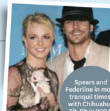
Spears and Federline in more tranquil times, with Chihuahua Bit-Bit in 2004.

Nordgren took possession of three of the couple's dogs after Woods' November 2009 car accident exposed to the world his infidelity. During their divorce proceedings, Woods and Nordgren each fought for custody of the dogs. Winner Woods has been seen walking the dogs. — JILLIAN ALBIN AND AUSTIN SIEGEMUND-BROKA